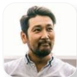
Developer and Analyst