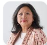
Planning and Business Alignment